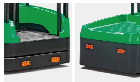
Front and rear flashing lights